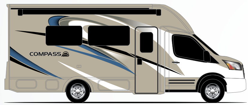
SMOOTH SAILING MHD-MAX